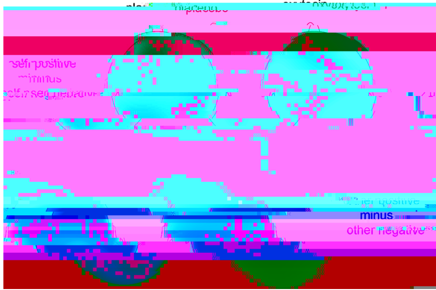
Fig. 2. Topographic maps of the ERP waveforms.